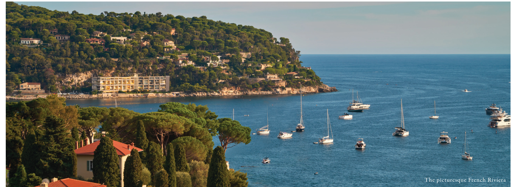
The picturesque French Riviera

This prestigious address, Plantation Road, once known as Bank Street, holds a rich legacy. From the grand residences of HSBC executives to the vibrant social scene of The Peak Club, this coveted locale has long been synonymous with exclusivity and refined living. Today, that legacy continues at Plantation Road, a contemporary tribute to The Peak's enduring allure.